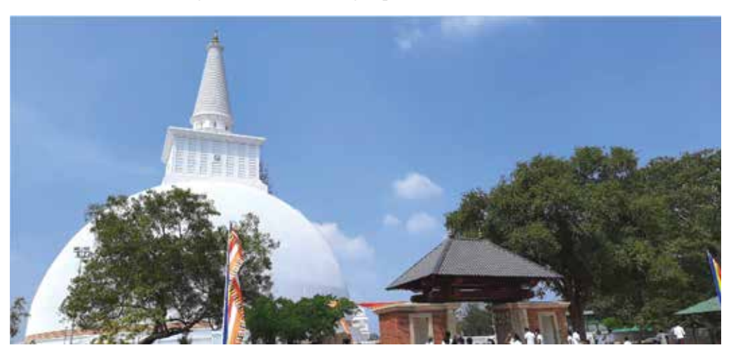
Sandahiru Seya in Anuradhapura

At the same time as the ceremony that initiated the Sandahiru Seya a crackdown launched by the security forces in the Tamil dominated northeast in the run up to Maaveerar Naal (held on November 27 each year). This is the day on which many Tamils around the world honor the memory of those who died in the campaign for external self-determination; an opportunity to memorialize Tamil sons and daughters.<sup>22</sup> In the conservative Sinhalese nationalist imaginary, the Tamils are denied the legitimacy of remembrance, in much the same way that democracy advocates in Thailand are denied any legitimacy and right to memorialization.