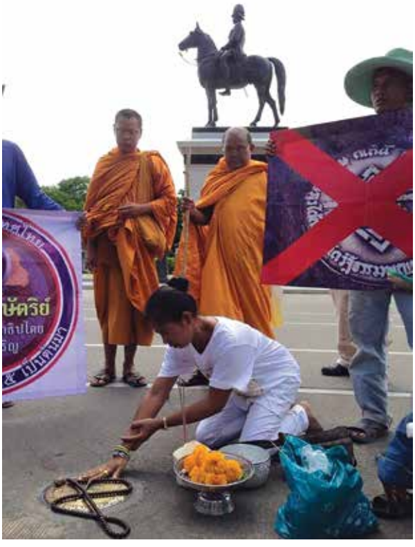
Royalists performing a "removal ritual" for the 1932 Revolution (democracy) plaque in Bangkok on 21 June 2015 with compliant monks [Photo from MThai reproduced in Prachatai https://prachatai.com/english/node/7090]. Note the statue of King Chulalongkorn (Rama 5) in the background. The plaque was actually removed in April 2017 and replaced with one which instead glorifies monarchy.

The 24 June 1932 was marked by an anti-Absolute-monarchy revolution under the People's Party ( Khana Ratsadon ) in Thailand, though short-lived as the royalists eventually seized back their power. A democracy memorial plaque to this event, until recently located at Bangkok's Royal Plaza and representing the revolutionary doctrine of the sovereignty of the people, was removed by the current regime (discussed briefly below).